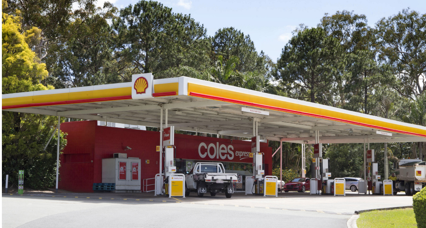
Shell Coles Express, Caboolture QLD