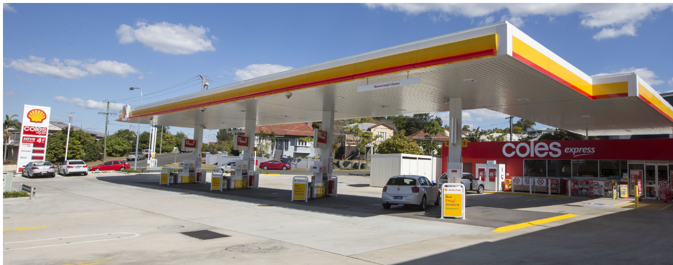
Shell Coles Express, Alderley QLD