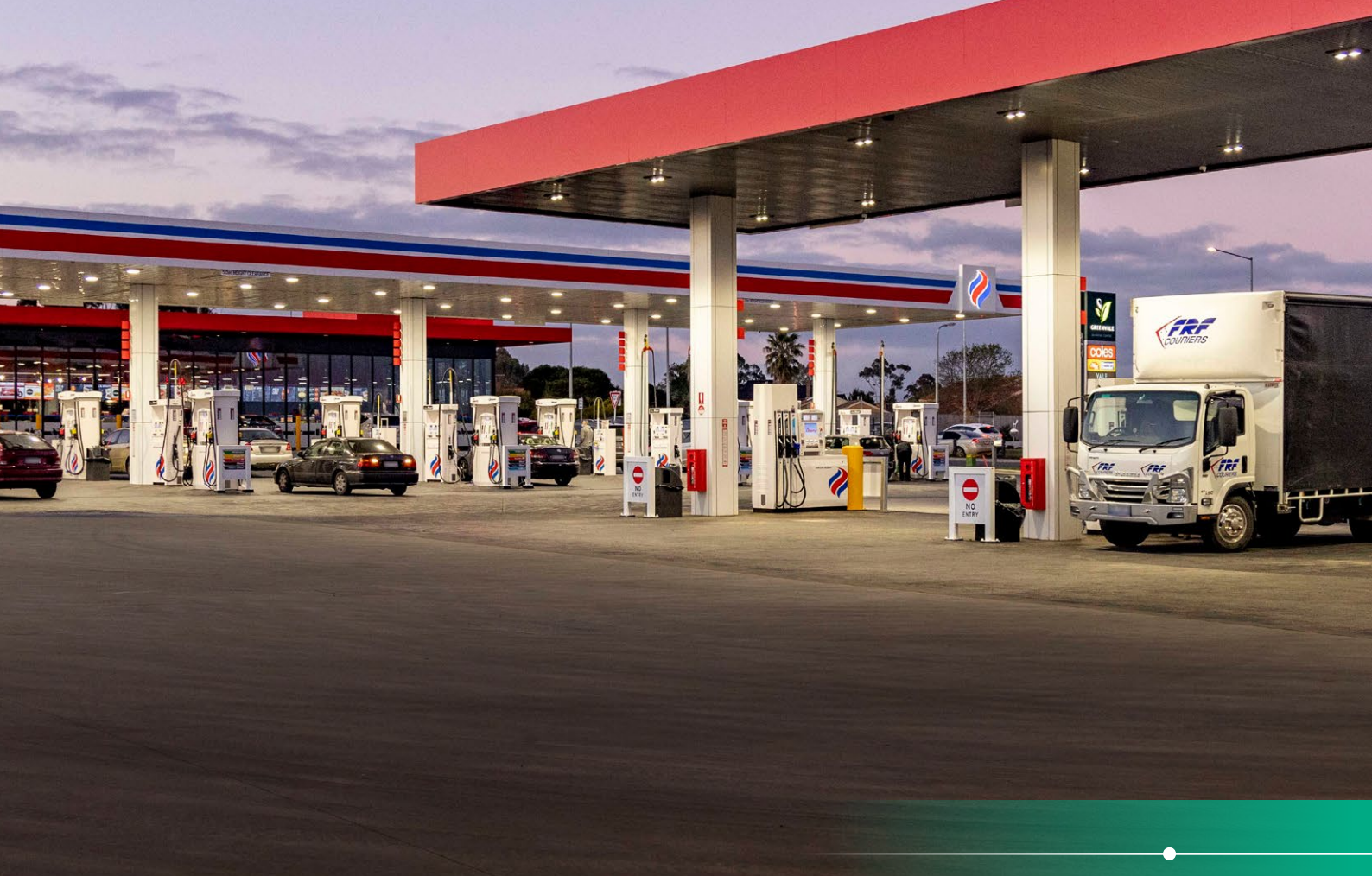
Image: Liberty Greenvale (VIC) Cover image: Shell Coles Express Coomera (QLD)